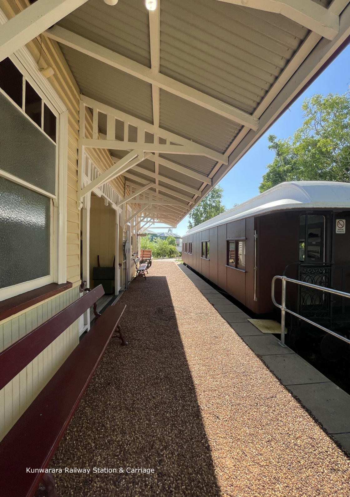
Kunwarara Railway Station & Carriage