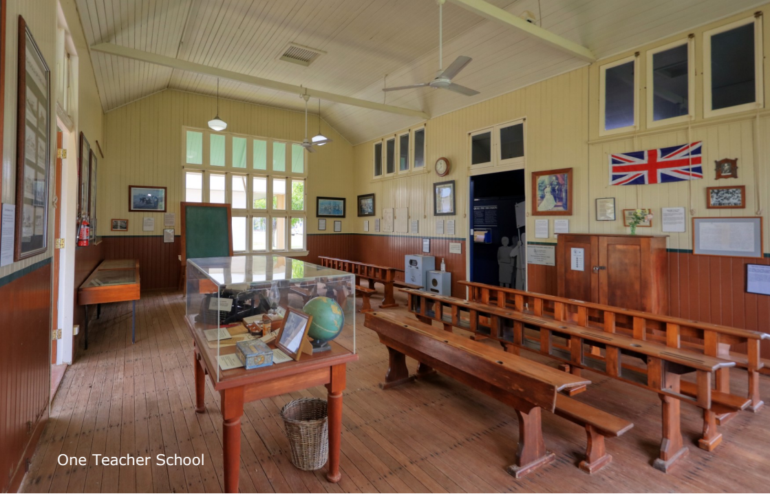
One Teacher School